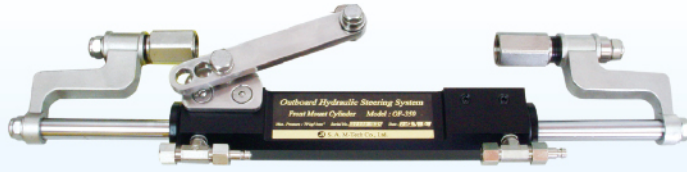
Outboard Cylinder : OF-350