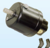
Helm Pump :SHO-18, 25, 35