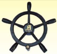
Wheel : SW-260