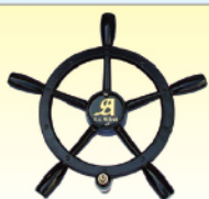
Wheel : SW-260