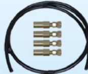
Hose : 3/8 " × 10m