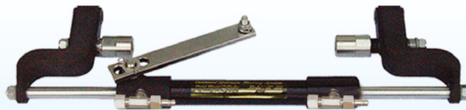
Outboard Cylinder : OF-100