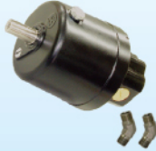
Helm Pump :SHO-18, 25, 35