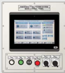
Main Control Panel (Consol Mounting)

For that reason, OCIMF recommends followings to all kinds of tankers to be built in since January 1st, 2019. Ships and terminals should be provided with the necessary equipment to enable inter-connection of Emergency ShutDown system ("ESD" hereinafter) and on activation of own ESD, the other party's ESD should be automatically activated.