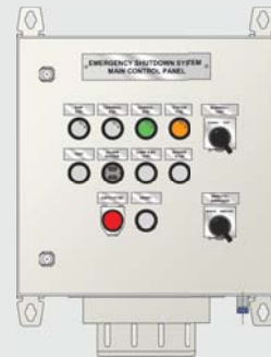
Main Control Panel (Lamp / Basic type)