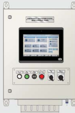
Main Control Panel (Wall Mounting)