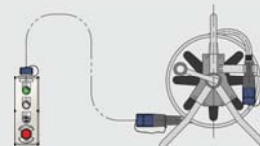
ESD Pendant Unit with Cable Reel

Our new development "Linked Emergency Shutdown System" is to apply to oil and chemical tanker and it fully meets OCIMF 2017 recommendation.