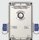
Side Box with Manual Push Button