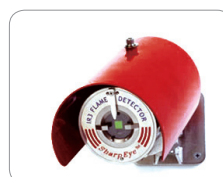
Weather Protector Protecting the detector from rain and snow