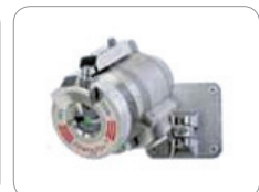
Air shield Using under tough environmental conditions