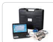
Mini Laptop Kit Re-configure settings or perform diagnostics