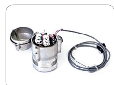
USB RS485 Harness Re-configure settings or perform diagnostics