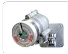
Tilt Mount Wall Mount bracket