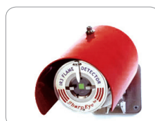
Weather Protector Protecting the detector from rain and snow