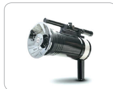
Simulators Up to 9m