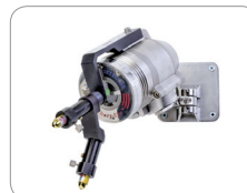
Laser Pointer Optimizing detector location