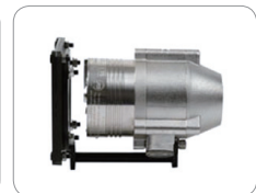
Duct Mount In high temperatures