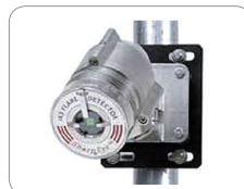
U-Bolt/Pole Mount 2" ~ 3" Pipe mounting