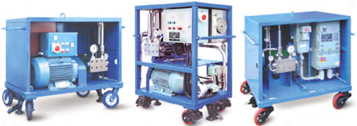
EL20 Standard unit

Ultimate Solution for Ship's own maintenance and small derusting job